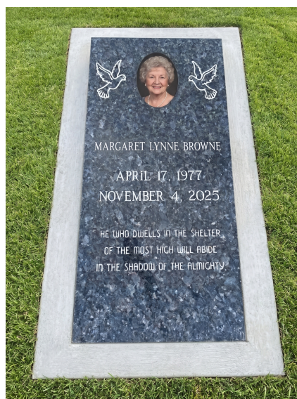
Flat Granite Tablet Style