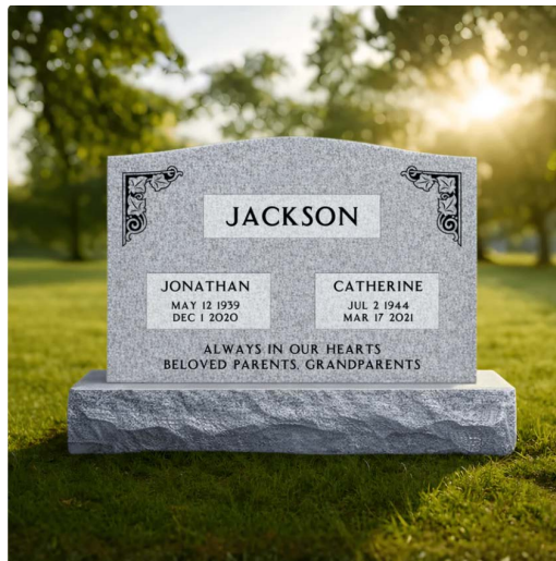
Example: Upright Granite Monument