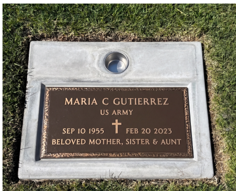
Flat Bronze 24" x 12"