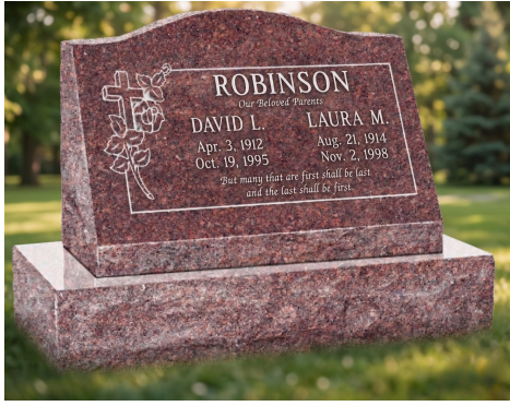
Single Slant with Base