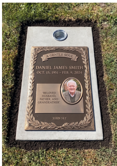
Flat Bronze Tablet Style