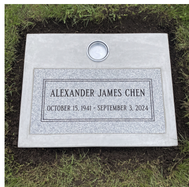
Flat Granite 24" x 12"